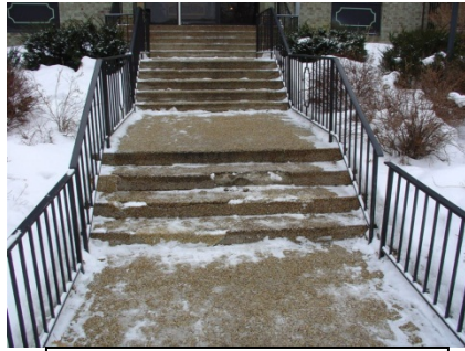
Pebble Stone, February 2008

of you remember, they quickly deteriorated for a variety of reasons including improper installation, time of installation (coldest part of the winter), and the use of non-compatible grouts. They too became an eyesore worse than the preceding pebble stone steps. After much agonizing and concern about selecting the right contractor and materials, this time, we settled on the molded, colored concrete design you see in the photo of the 1945 steps taken on April 27. The 1955 steps will also be completed shortly followed by reinstallation of the handrails. Hopefully, this will be the last you hear of that long tale of woe. We hope you like them . . . and continue liking them! With any luck, they should outlast all of us!