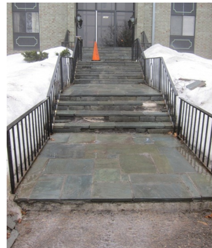
Bluestone, Winter 2011